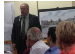
Board backs senior housing project