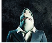
Shark Tank Just Revealed a Trillion-Dollar Idea The Motley Fool